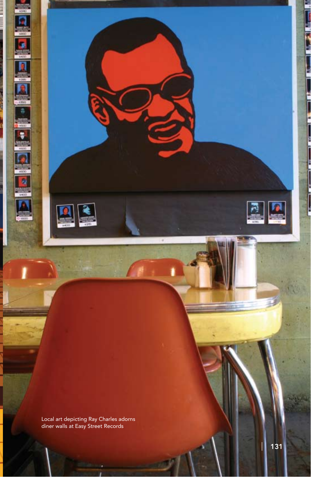
Local art depicting Ray Charles adorns diner walls at Easy Street Records