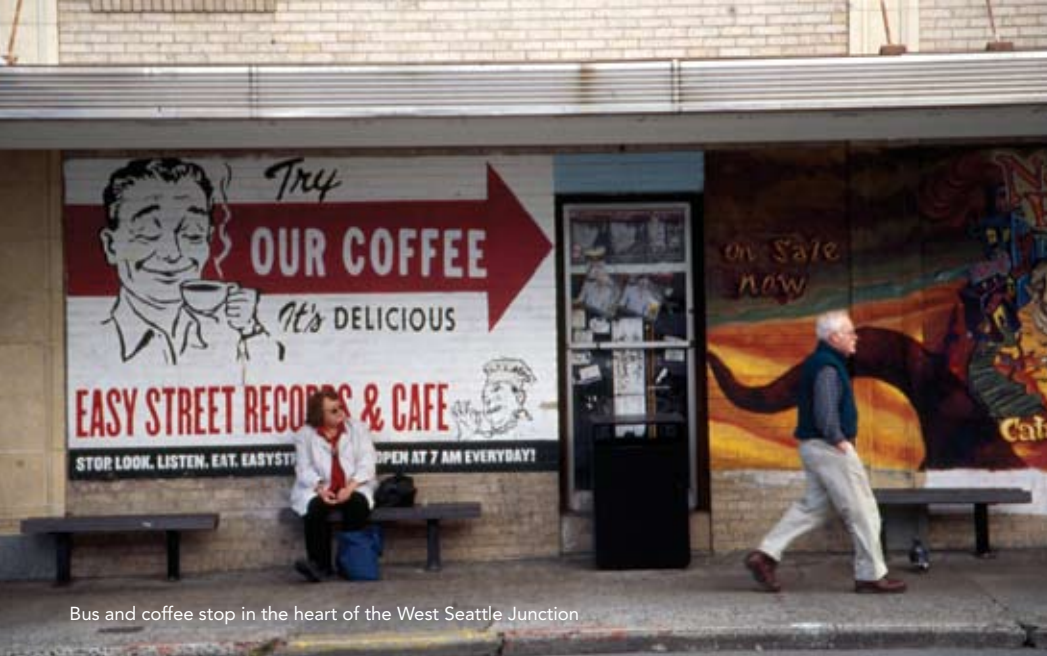
Bus and coffee stop in the heart of the West Seattle Junction